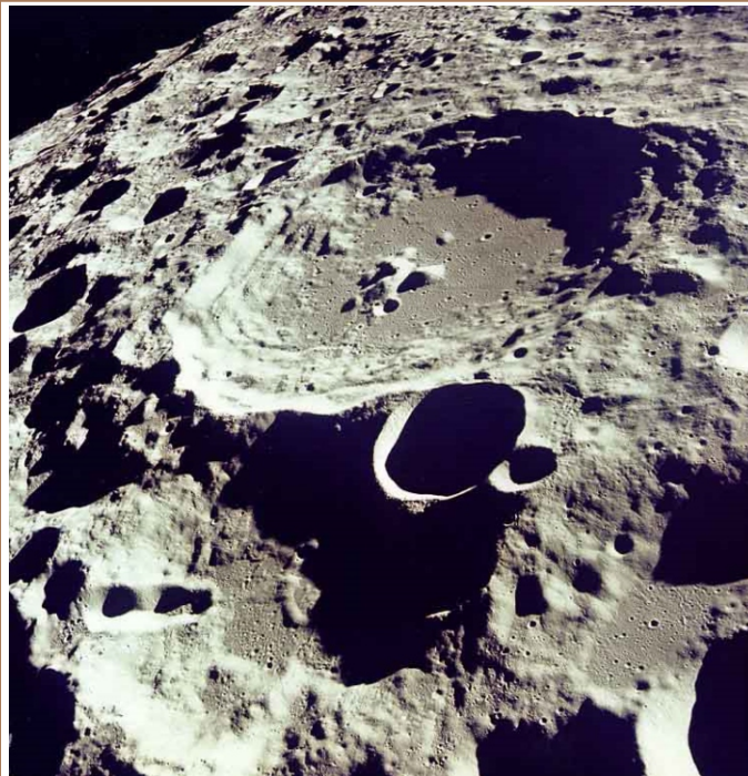
FIGURE 1 Sample image of moon craters.

http://www.nasaimages.org/luna/servlet/detail/NVA2~4~4~4929~105455:Lunar-Farside-from-Apollo-11