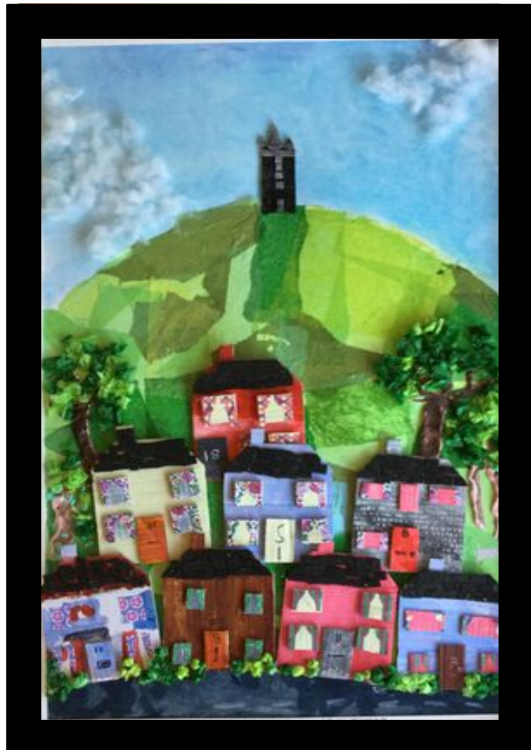
At Home with Scrabo

'You know you are home when you see Scrabo and we see it every day'