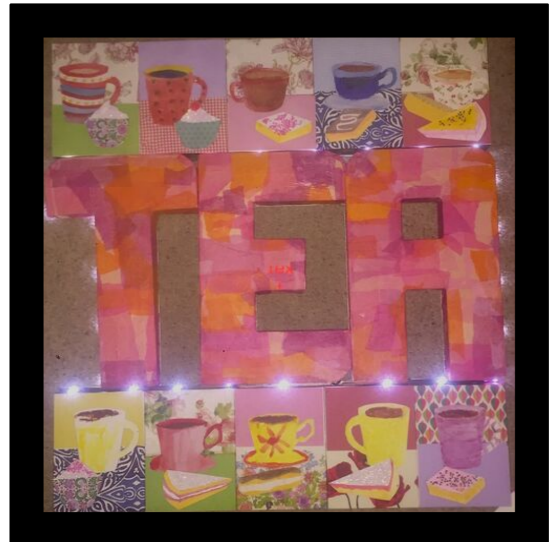
East Side Dinners

'You know you are home when you see Scrabo and we see it every day'