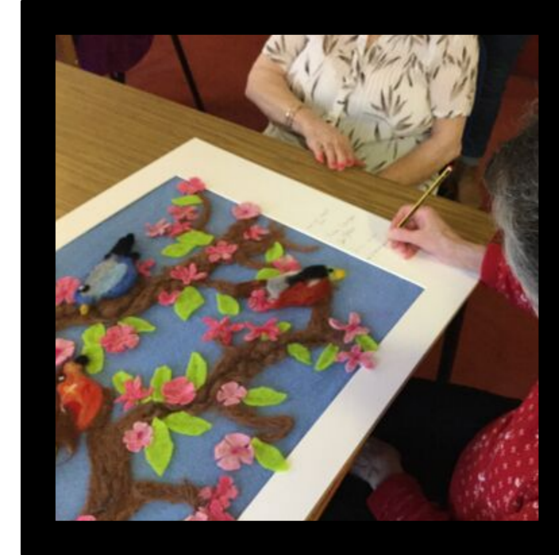
Birds of a Feather Flock Together