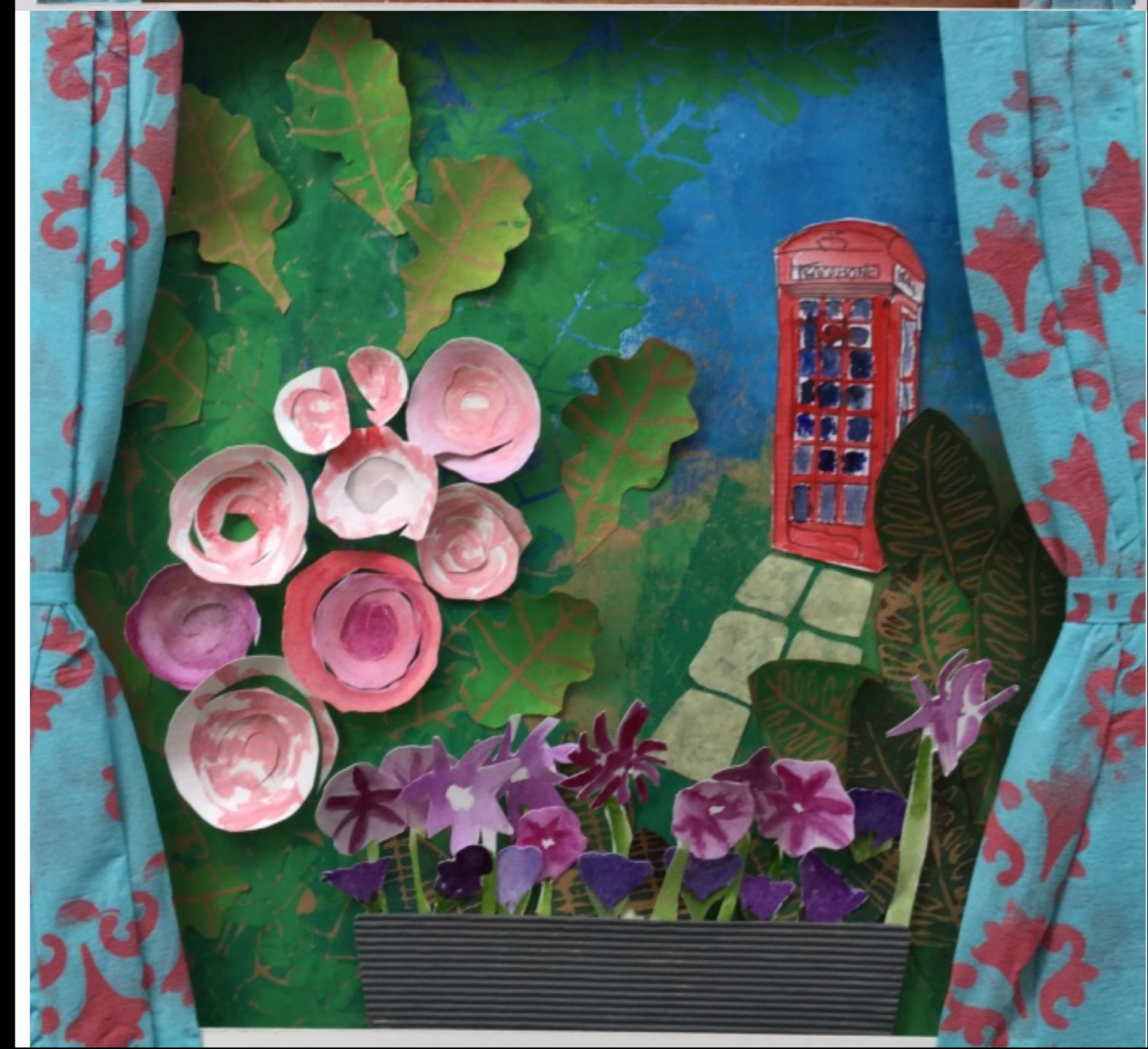
Inside out and outside in