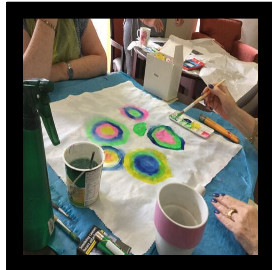
No Stitch Cushions