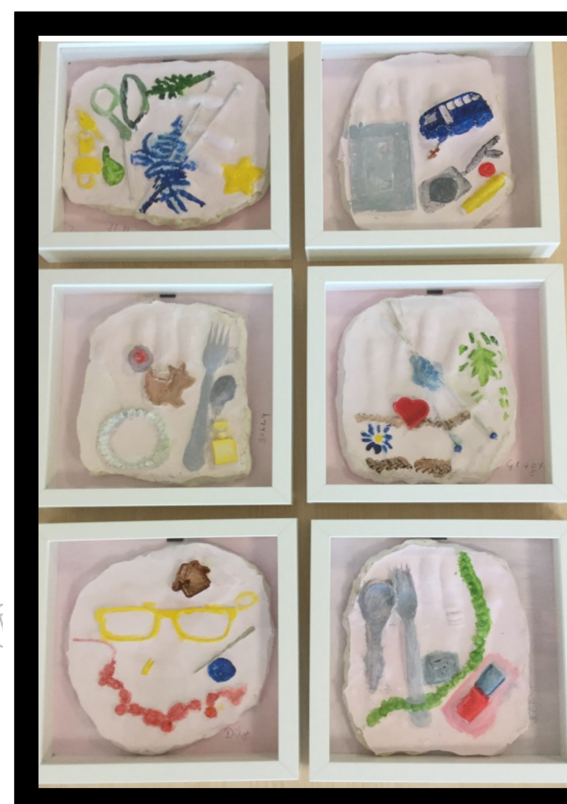
Hands of Time