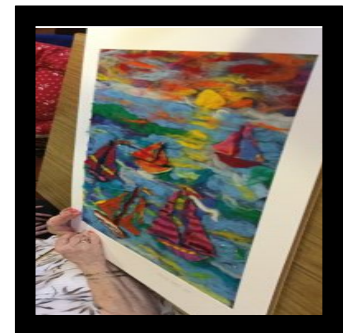
No matter where we go in the world, it's good to be home again

Art based research presents new opportunities for people living with dementia to engage and express themselves without a focus on language. To explore the lived experience within technology enriched housing for people living with dementia, sixty-four participants took part in forty-eight art-based focus groups across eight housing schemes within Northern Ireland. The output of the qualitative research is illustrated in this poster.