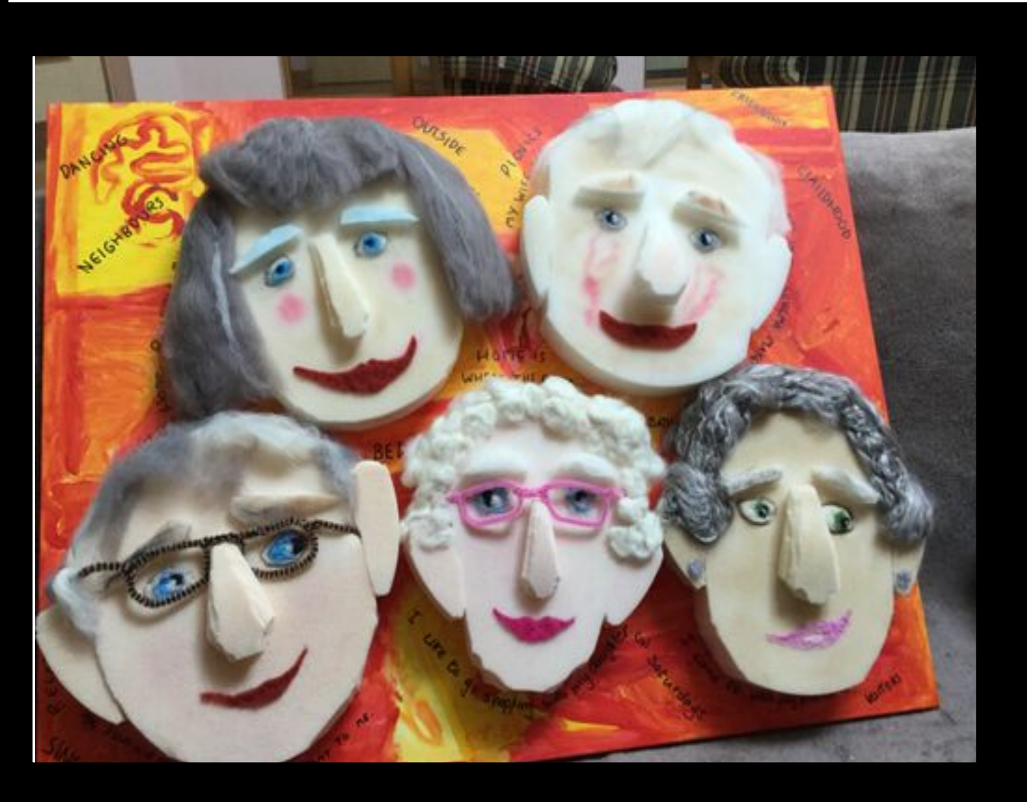
This is Us