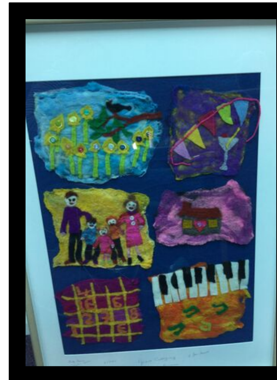
The American Patchwork Quilt