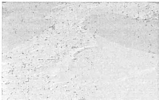
Fig. 1. 3D image of large moraine feature surveyed and associated "outwash plain". Image oriented to the North.