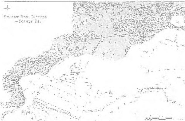
Fig. 2. Hillshade derived from Multibeam bathymetry, showing rock outcrops surveyed to the southwest of area and associated onshore geology (from GSI 100K Bedrock Series).