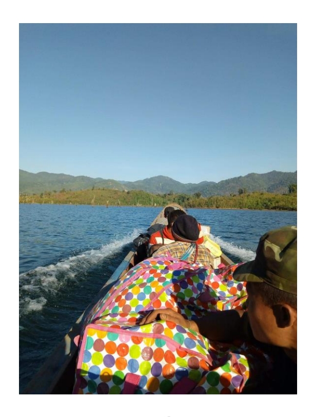
FINAL REPORT APRIL