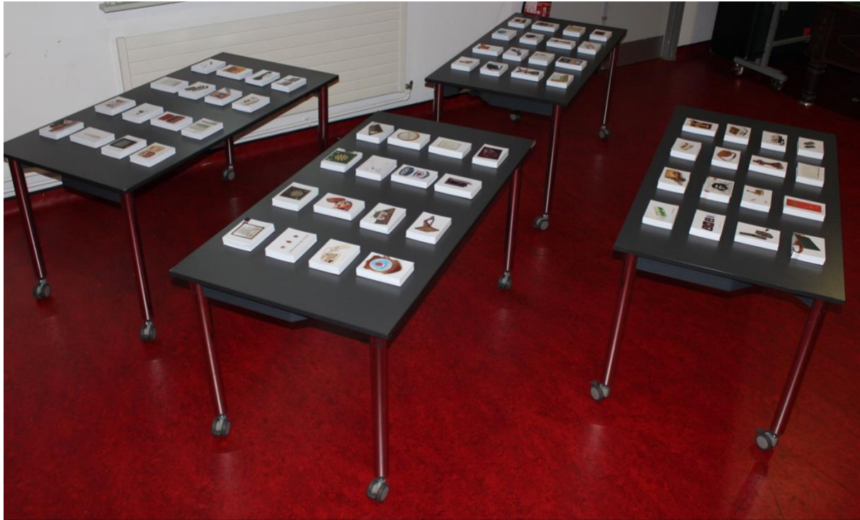
Krenn & O'Beirn, 'Transforming Long Kesh/Maze', touring exhibition, 2018 Documentation of edition of 64 postcards in 'Féile an Phobail' Ireland's largest Community Arts Festival.