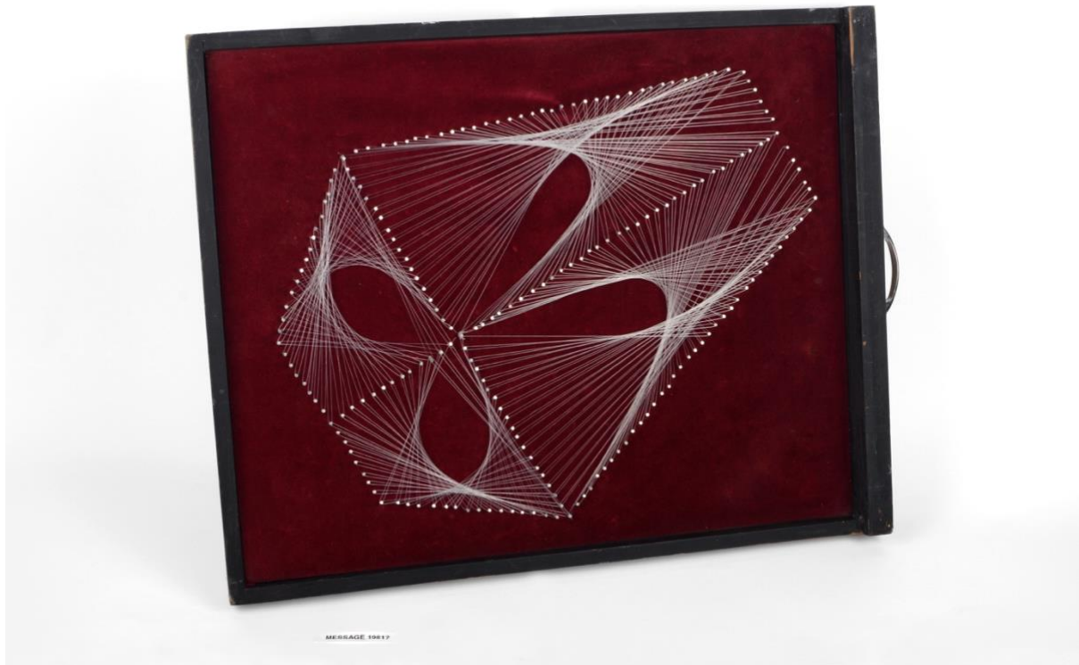
Krenn & O'Beirn, Message, 1981?, 2018 Photographic print of artefact

Materials: Chalk, found display drawer lined with plum-coloured velvet, fishing line, panel pins.