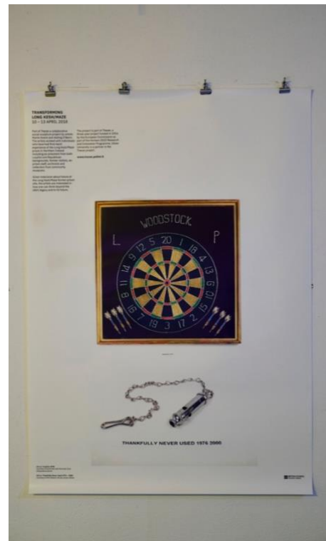
Krenn & O'Beirn, 'Transforming Long Kesh/Maze', touring exhibition, 2018

Documentation of edition of 64 postcards in 'Peace and Beyond Arts Fringe' an arts event coinciding with the 'Peace and Beyond International Conference' to mark the 20th anniversary of the Good Friday Agreement. The conference, which ran from the 10th - 13th April 2018, was organised by the British Council.