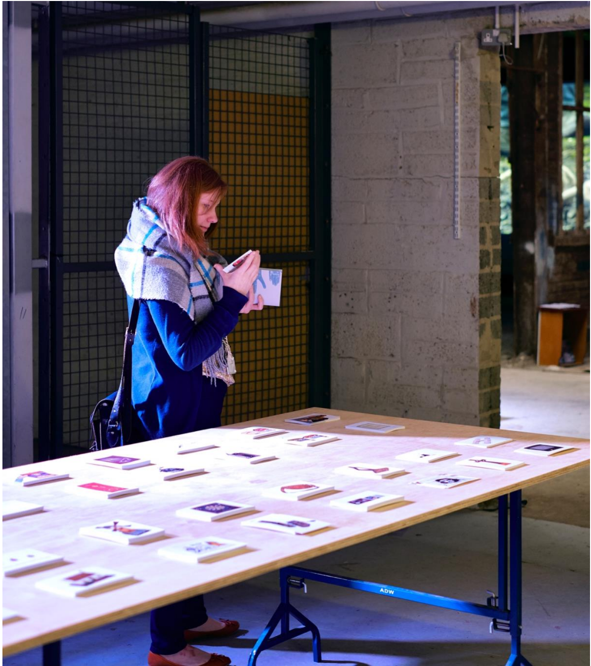
Krenn & O'Beirn, 'Transforming Long Kesh/Maze', touring exhibition, 2018

Documentation of edition of 64 postcards in 'Peace and Beyond Arts Fringe' an arts event coinciding with the 'Peace and Beyond International Conference' to mark the 20th anniversary of the Good Friday Agreement. The conference, which ran from the 10th - 13th April 2018, was organised by the British Council.