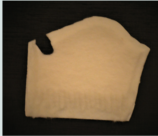
Figure 5. Shows a semi-compressed felt pad to reduce pressure over fifth metatarsal head area.

education, these are reported in the the International Working Group on the Diabetic Foot (IWGDF) Guidance on Prevention (Bus et al, 2016). However, the use of these interventions is based on low quality of evidence or expert opinion rather than good quality research evidence.