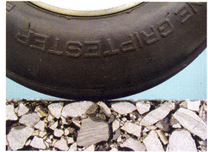
An ASTM friction measuring tyre resting on a cut section of asphalt.

Bitumen can be modified to make it stick better to the road surface aggregate particles. Exposure to the sun, heat, cold, water and oxygen will change its