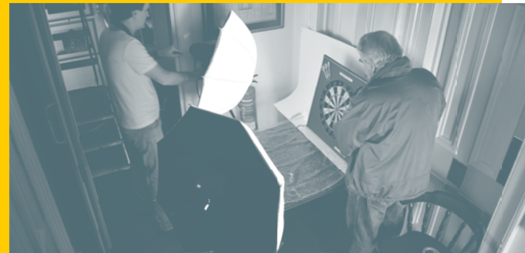
Photoshoot in the Roddy McCorley Society Museum