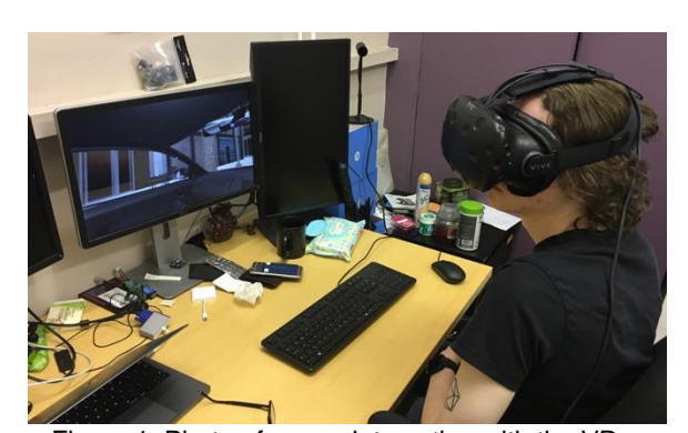
Figure 1. Photo of a user interacting with the VR application.

The VR system was built using the Unity 3D engine. It uses the HTC Vive HMD. The Vive's resolution is 1080 x 1200 pixels per eye, and has a refresh rate of 90Hz.