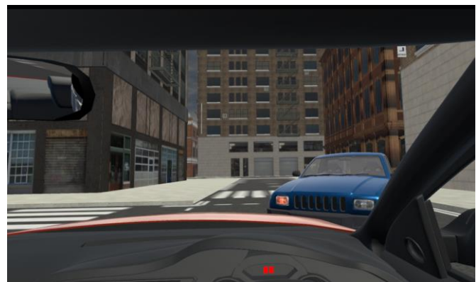
Figure 3. Screenshot of the driver's perspective.

Figure 3 shows a screen from the system during the "Car not stopping at junction" hazard.