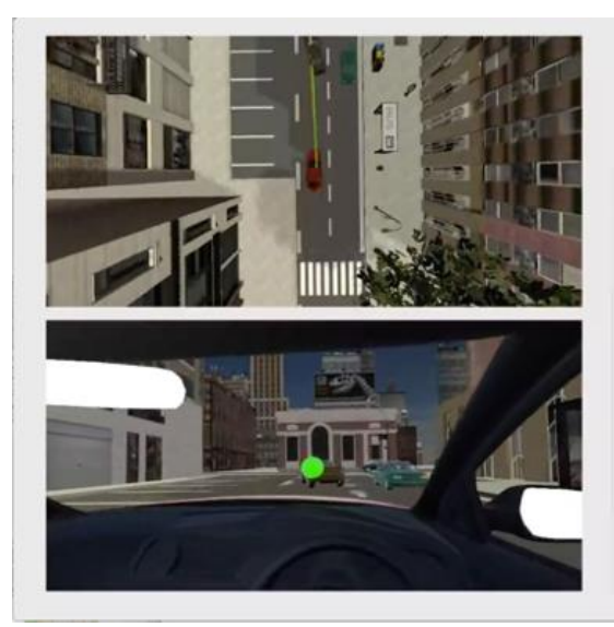
Figure 4. Screenshot of system visualising gaze information

The head tracking data, along with data about the virtual environment as well as the position and rotation of the subject's vehicle in that environment allow us to compute the direction of the subject's head along with information about what is in front of them. Figure 4 shows a top-down (above) and point-of-view (below) heat map of the subject's gaze on the left, and shows information about the observed object(s) on the right, including how long the subject has observed each object in each instance. This screen capture is taken from the "Car reversing from a bay" scenario.