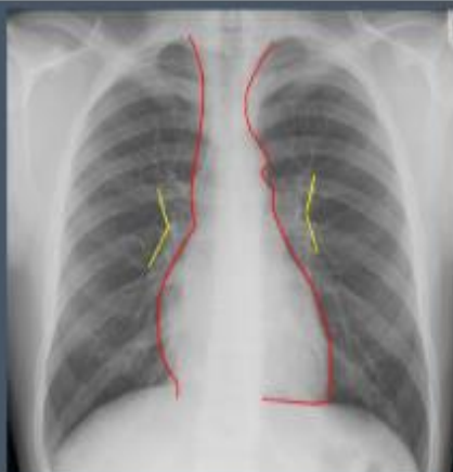
Figure 1: An example of the questions and diagrams included within the online training tool.