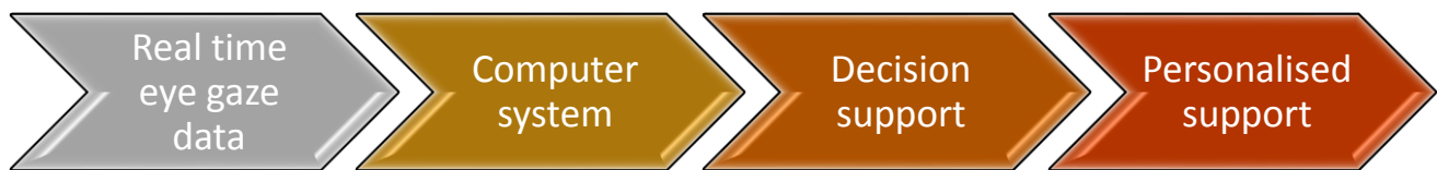
Figure 3: Real time eye gaze data could inform a computer system of interpreter uncertainty, confidence, competence and areas that were not appropriately interrogated - this coupled with decision support could be powerful personalised support.