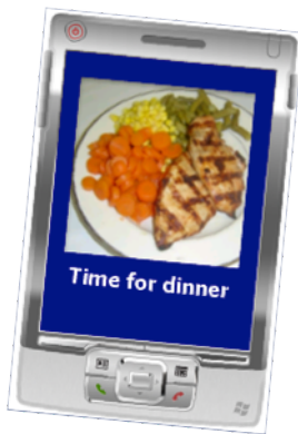
Figure 4 - CCA showing a reminder

The memory support (day and time indication, reminders), picture dialling and the radio control were especially perceived as helpful by the persons with dementia. Also, the mobile device (CCA – see Figure 4) was valued positively.