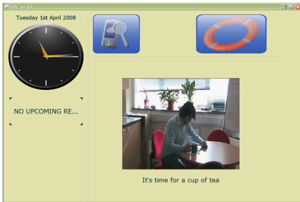
Figure 3 - CDN showing personalised interface

The memory support (day and time indication, reminders), picture dialling and the radio control were especially perceived as helpful by the persons with dementia. Also, the mobile device (CCA – see Figure 4) was valued positively.