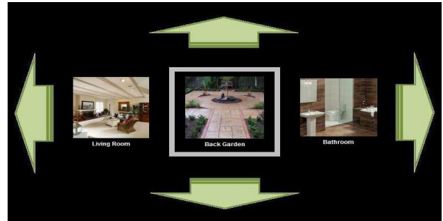
Figure 1: IGUI showing high level location menu within the Smart home

markup language (xml), which facilitates the declaration and description of structured classifications. In this manner a menu hierarchy is defined and menu icons associated with appropriate commands. By using xml in this manner the GUI becomes a menu parsing facility. This makes it possible to harness the interface for many different purposes or to facilitate the tailoring of the interface according to individual user needs. The GUI provides the user with navigation through various locations in the smart home. In Figure 1, the menu indicates current location as the "back garden". The down arrow can then select 'controllable' smart devices in this location.