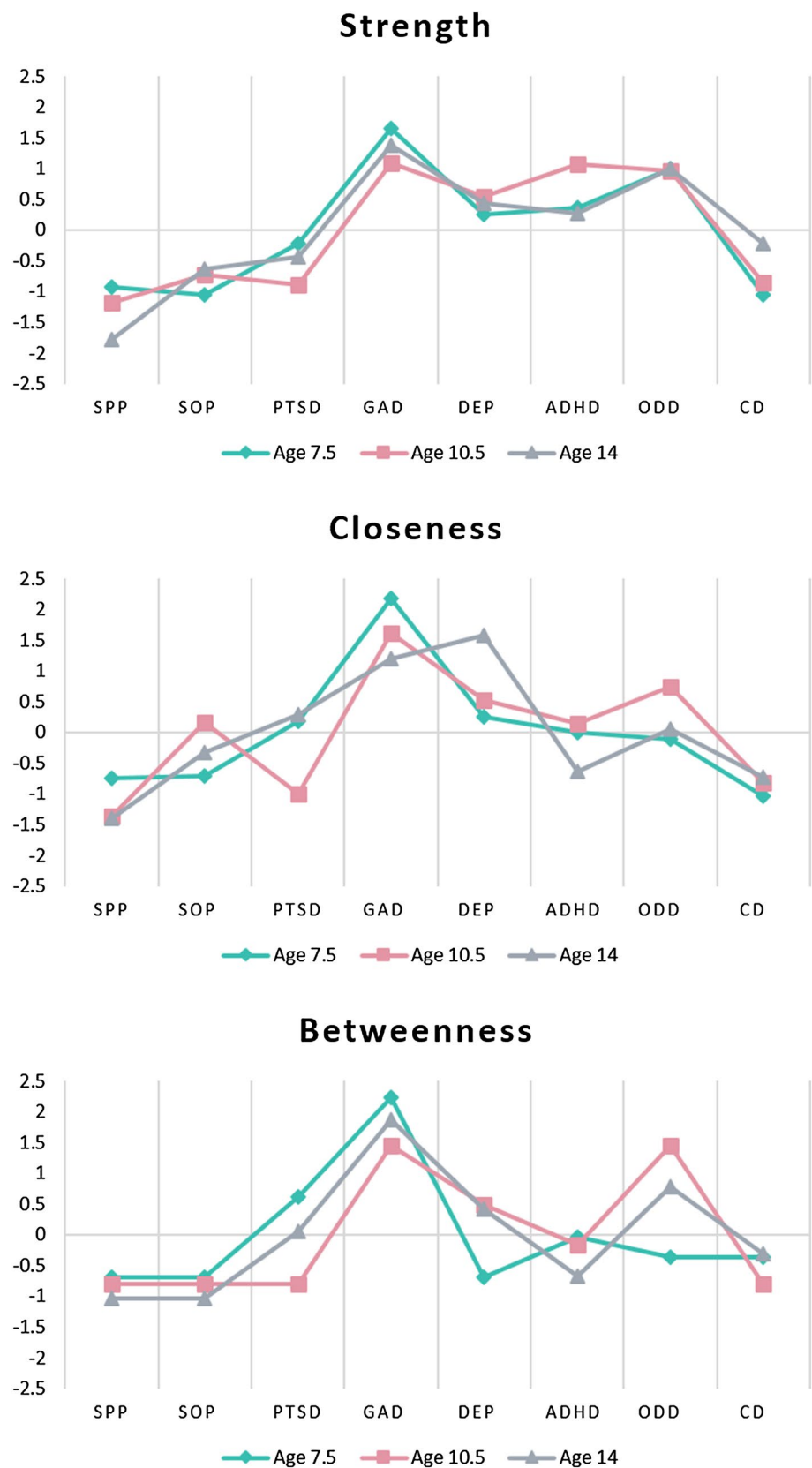
Fig. 2 Centrality statistics for association networks at the three time points. SPP specific phobia, SOP social phobia, PTSD post-traumatic stress disorder, GAD generalized anxiety disorder, DEP major depression, ADHD attention deficit hyperactivity disorder, ODD oppositional defiant disorder, CD conduct disorder. Centrality values (y axis) presented as z-scores