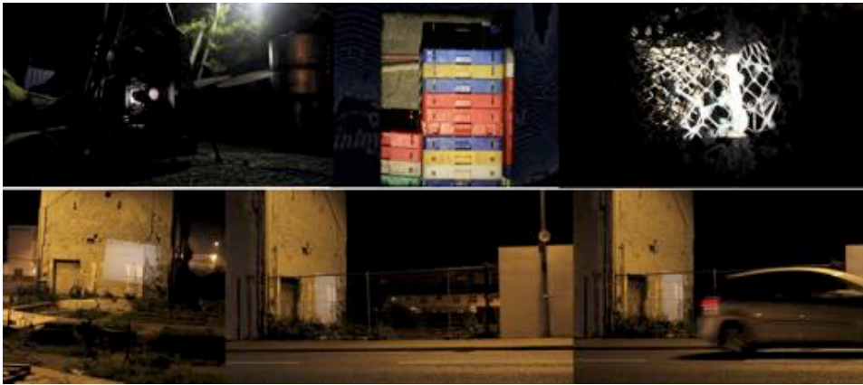
Fig. 04. “Elmo” An MArch student experiment in expanded cinema

The influence of the first stages was an immediate move to experiment and try to apply different techniques without as much perceptible pre-judgement as the first films. One group of students took it upon themselves to purchase a used 8mm projector, immersing themselves in the town over a couple of days. Their example in Figure 04 draws heavily on Raban's Diagonal , projecting an analog square of light onto selected surfaces that is captured through the digital process.