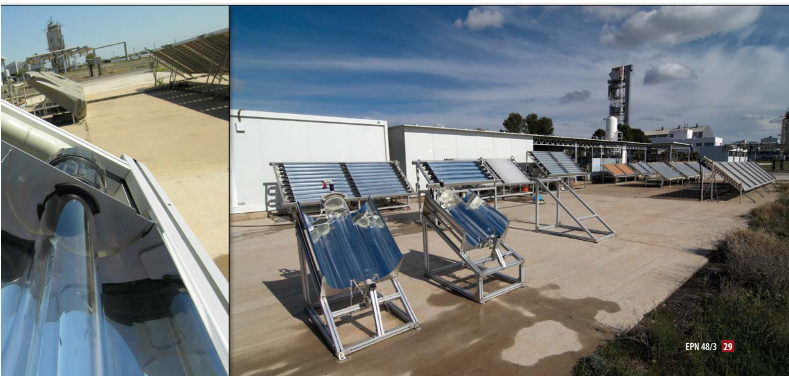
▼ FIG. 5: View of several solar CPC reactors with different design concepts installed at Plataforma Solar de Almería, Spain.