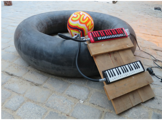
Migrant Swan Song, 2017 Inner tube, pipes, wood, melodicas, tubing and compressor.