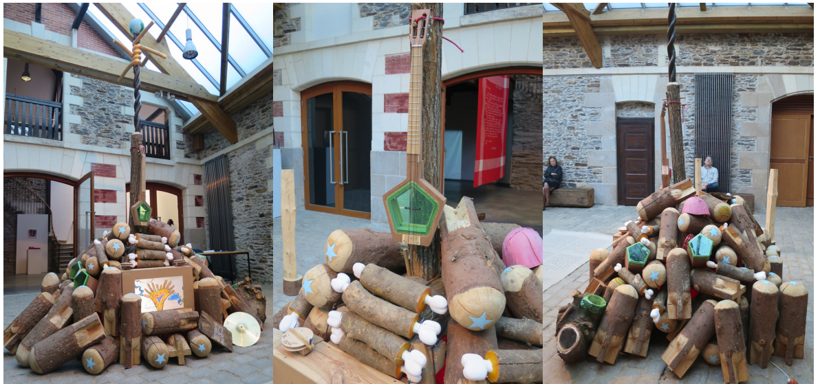
Mass of the world, 2017

The work overall offers lots of rich readings or encounters. We prefer the idea of 'encounters' to 'readings' – as the work is very actual, it is present and made of things with 'thingyness'. There was no clean fixed idea from the start so hopefully it has allowed a very rich and complex set of things and encounters to happen. Playful but dark.