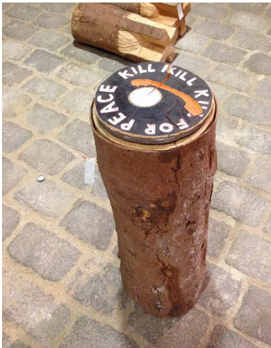
Kill Kill For Peace, 2011 Tree trunk and acrylic paint.