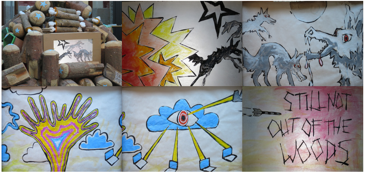
Nottanum –pata-pataphysical edit, 2017 Wooden crankie box, paper roll with acrylic paint.