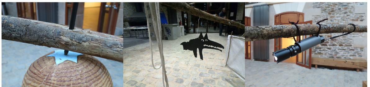
Lumiere de Loup, 2017

Carved painted wooden bombs, carved painted wooden bones, wooden drums with plastic skins, timber, carved wooden post.