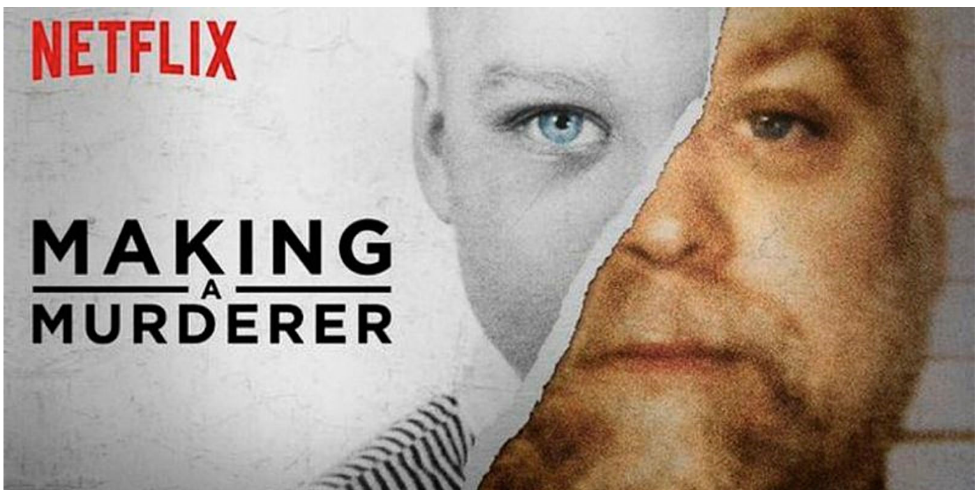
Figure 1. Making a Murderer Titles.

The opening episode of the American documentary series Making a Murderer (2015) introduces the story of Steven Avery, a man who is wrongly convicted of rape in 1985 and as a result spends the next eighteen years of his life in prison. We see how these lost years are followed at first by a seemingly happy ending, as in 2003 Avery is released when DNA evidence clears him of the crime. We see Avery decide to file a lawsuit against the county that convicted and imprisoned him, a lawsuit that would total $36 million in damages. It is difficult to imagine, given the injustice suffered, that the suit would not be successful. Then, in a strange twist, Avery is arrested for rape again, and this time also charged with murder. The victim's name is Theresa Halbach.