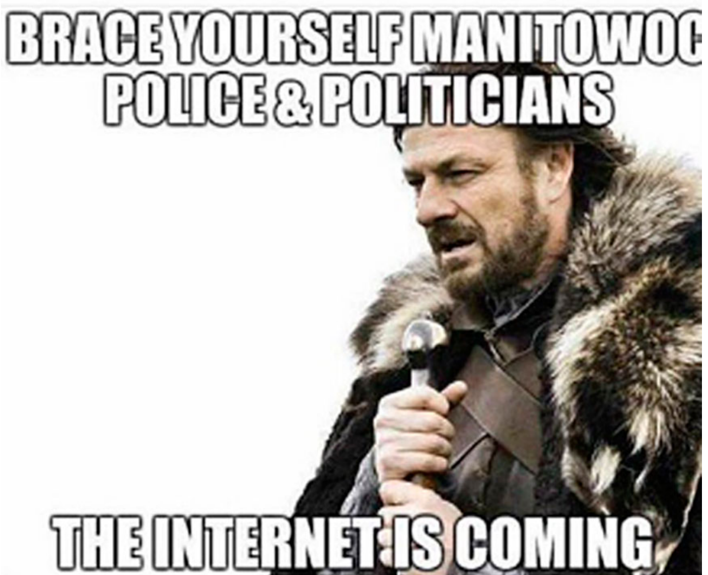
Figure 7. Making a Murderer and Post-Digital Writing.

The investigation, as a narrative, is open and in movement and adds depth to the media experience. 33 Not all of the puzzle pieces are clear, and the authors of the stories, both the series writers Laura Ricciardi and Moria Demos and the participatory audience who are continually writing and rewriting elements of the text outside of the fixed televisual content, aren't even aware of the final pieces of the puzzle, or what the final solution to the riddle is.