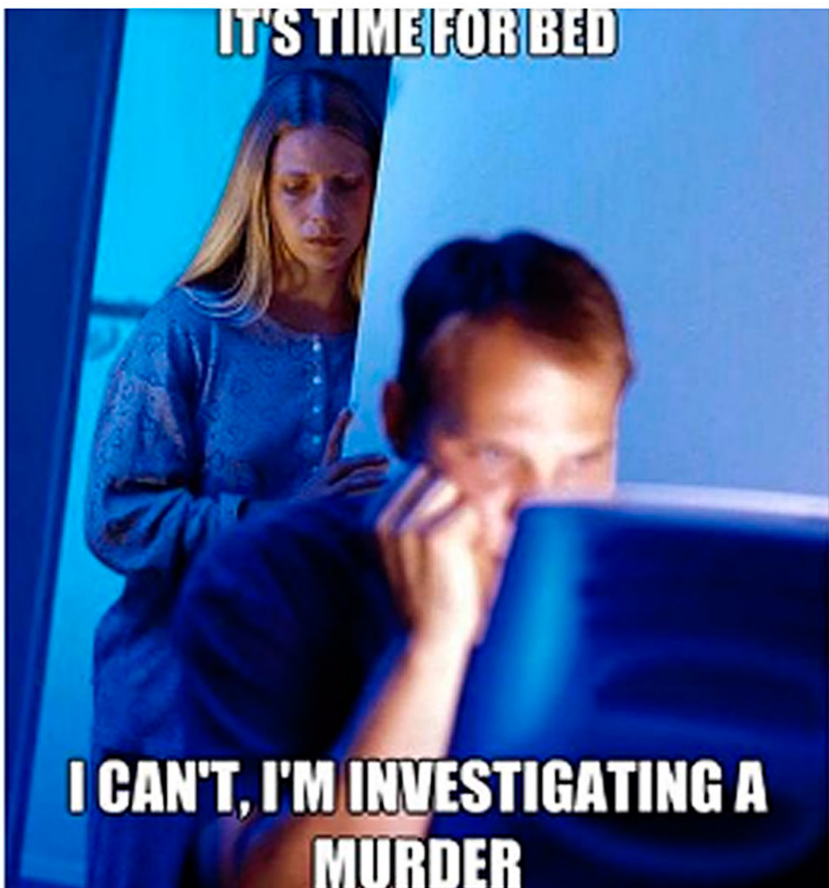
Figure 6. A community created meme reflecting on the forensic fandom in Making a Murderer .

point home, or give us closure. In that sense, the text is more like a game. In part at least, the experience of unsolved crime series has become more playful because forensic fandom is fairly game-like: active, interactive, narrative-building, narrative-solving. 25 But the series seems at times to lay out a series of clues—albeit in heavy-handed fashion—implicitly offering up the narrative as a thing to be pieced together into a coherent, truth-telling picture. In reality, truth is complex and the unspoken view the series takes on the case is simplistic; but, for example, in the final episode, after we learn that the Supreme Court has refused to review Avery’s case, we listen as Avery’s lawyers lay out the remaining possible approaches to proving innocence, which largely centre around investigative work yet to be done. With the failure of the U.S. criminal justice system to investigate adequately now patently clear in the narrative, the outlining of possible alternate routes is signposted, practically with red flashing lights, as a moment in which someone else (we?) are dared to take action.