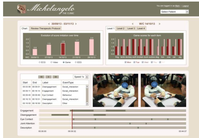
Fig. 3. Michelangelo Project aggregated data visualisation on Clinical User Interface

The clinical tools also permitted further EEG analysis, which comprised off-line, artefact removal (using video playback to identify an appropriate resting state period), followed by event identification, such as eye contact during the task, during which the related EEG signal was processed via clustering techniques in order to identify areas of interest. The clinician is subsequently able to view the results from the analysis, select the appropriate number of synchrostates and visualize the corresponding brain activity for the event [31]. Consequently, such tools, which incorporate EEG as another physiological component, can potentially provide additional insights into both the treatment and understanding of the underlying conditions.