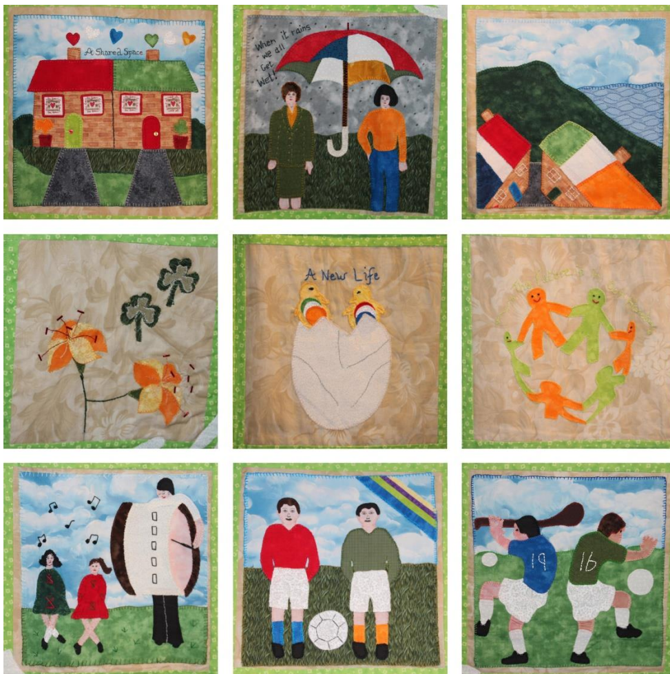
Figure 9 Quaker House Belfast, Shared Visions , 2008 (details)

quintessentially Gaelic game with a football that is more associated with British dominant sport. Of the 36 squares, 21 express their idea of an inclusive society in terms of an equal balance of both sides, represented mostly by the balancing of colours or symbols, Figure 9. Rozsika Parker described the suffragettes' use of symbolic imagery to demand "equality, not androgyny." 29 Perhaps this is what these makers want, to live side by side in equality and peace but retain their identity – in the imagery, even the newly hatched chicks have emerged from a shared egg draped in their identifying flags. The purpose of the Shared Visions quilt was to create a process where women from conflicting backgrounds came together round a table to stitch. The making process is a shared activity with a shared goal and sewing creates a space where the hands are busy and there is no need for direct eye contact or conversation - communication is therefore facilitated without reconciliation being forced. For women coming from diametrically opposed political positions this was critically important.