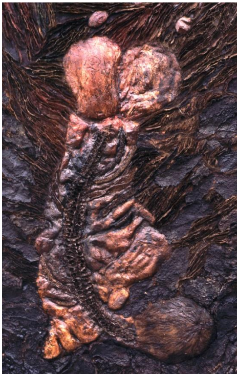
Figure 1 Catherine Harper, Head Down , 1990 Mixed natural media and bitumen, 180 x 230 cm

symbolic and practically functional as part of a rural agri-culture. 5 Trained as a weaver at the Belfast School of Art, (Ulster University) in the mid-1980s she used this landscape to explore feminist concerns and the place of women in a divided society. The context of the time and place is important and Harper's bog work was informed by Ireland's prevailing revelations and considerations of "infant bodies found under floor-boards and hidden places", the plight of girls with unwanted pregnancies, the lack of political will to provide abortion, and the ongoing religious conservatism around contraception, illegitimacy, shame and sexual morality. Harper explains, "the bog metaphor was a way that I could talk about kinship and relationships, women, the space of women, without actually having to identify what exactly I was concerned with directly – so oblique". 6 The bog landscape in Ireland has recently become highly politicised as a landscape that conceals and reveals, sucks life down, and gives up bones and fragments of cloth. A 2013 BBC documentary opened and closed with Seamus Heaney reading his poem "Bog Queen" (from North 1975) over footage of the bog lands in the heart of Ireland where the bodies of the "disappeared" are believed to lie. 7 Harper's art, like Heaney's poem, takes on an additional resonance in this context, Figure 1.