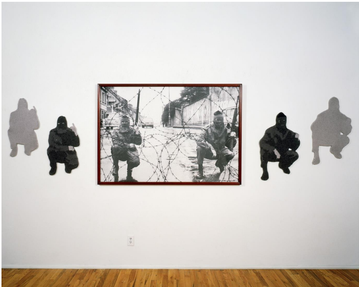
Figure 6 Elaine Reichek, Easter Lilies (IRA Provisionals) , 1992 Wool, photograph, 5 parts, overall: 110 x 400 cm

dialogic engagement”. 18 However, in 1993, with the Troubles still on-going, most people in Northern Ireland lacked sufficient distance (emotional or temporal) to engage in open-minded dialogue that transcended the all-pervasive oppositions of religious and national identity, partisan politics, one side or the other. In Easter Lilies (I.R.A. Provisionals) Reichek took the two figures in the photograph and knitted them twice, placing them either side of the original image; the first knitting removed the guns, and the second greyed the figures out so they receded into the gallery wall. It would be interesting to see this work exhibited in Belfast, post-conflict, with the figures and the threat receding into history and the space for public dialogue opening up. The iconography of the original photograph and the removal of the figures from their paramilitary context through the act of knitting would now come to the fore and raise questions about power and identity.