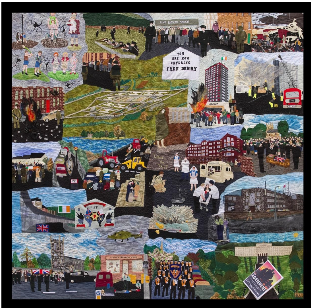
Figure 8 WAVE Ballymoney, Quilt of Remembrance , 2014, 210 x 210 cm

hanging has allowed the imagery to be direct and representational rather than symbolic and universal. It still focuses on common rather than individual experience, so people from both (and neither) sides of the sectarian divide can find their experiences of the Troubles represented. The finished quilt is full of details (not only of the conflict) but also of daily life during the 1970s. This new quilt indicates a growing readiness to explore an account of life in Northern Ireland during the Troubles that can accommodate multiple and conflicting memories and histories. Participants worked on panels and incidents that they personally found difficult in “recognition that suffering takes place independent of religion or cultural background.” 27 The quilt treads a careful line in balancing conflicting memories, evidence of many hours of discourse and a high level of awareness and sensitivity to the complexity of the task.