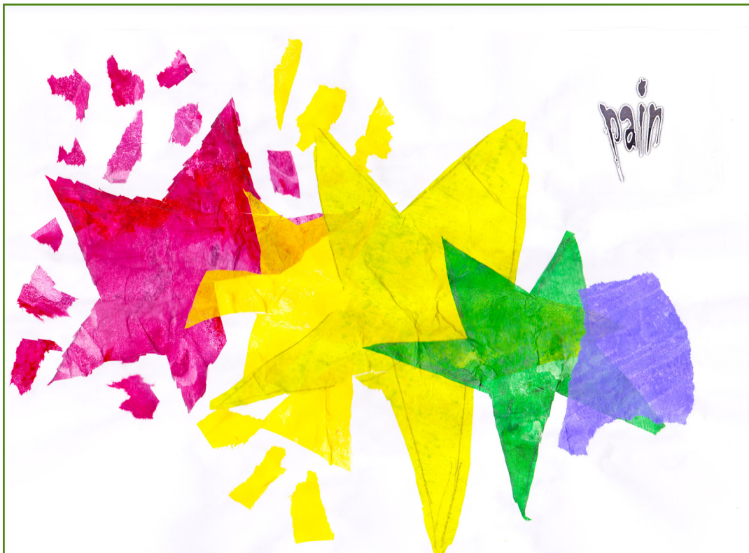
Figure 3: Essences identified from creative activity