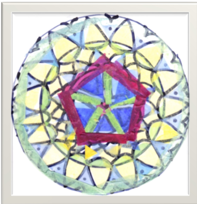
Figure 2: Brian's mandala

Towards the end of the session, we chatted informally about many things, including ourselves, our jobs and some barriers to creativity. Illuminating snippets of conversations not only provided individual perspectives but also bridged the gap between planned learning and that which occurred more spontaneously; they contributed to our learning and made it more memorable. Later, various attempts to stuff the multitude of tissue paper fragments into a relatively small bag led to important connections and insightful learning. Originally transformed from their colourless beginnings by patients engaged in therapeutic activities, these soft scraps are testimony to the various events and experiences to which