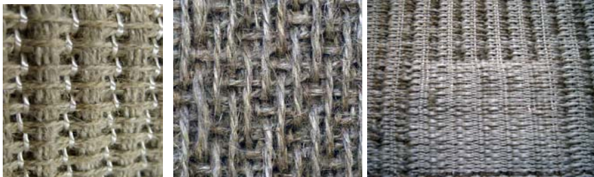
Fig 1: 3D woven natural fibre orthogonal (Left), integrated (Right) and tailored hybrid preform (Bottom)

Soden [22] has developed extensive ranges from 3 to 20 layer structures with areal densities in the range 1000-3000 g/m 2 and up to 5000g/m 2 . An ever-expanding range of application specific, thick, multiple layer 3D reinforced structures, and new innovative shaped configurations have been produced. Tailored towards more demanding structural components, these natural fibre materials aim to demonstrate enhanced mechanical properties compared with nonwoven, or plied woven laminates used currently.