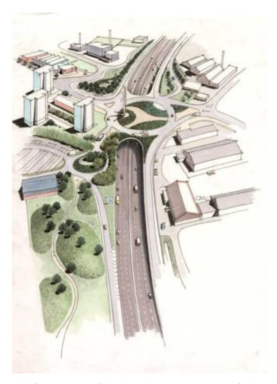
Idealised flow: an artist's impression of the Broadway interchange, as envisaged in 2005.