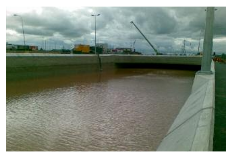
Non-ideal flow: the flood at Broadway underpass, 16th August 2008.

pylon) and which left the space far more open, seems inadvertently to have facilitated this rioting. Clearly a very different subjectivity to that which might help to construct and consume the promised normative city is invoked by rioting; and very different processes are expressed in it than the economic and political impulses guiding regeneration. A pedestrian, local, geographically-bounded mode of subjectivity, performing a fear of 'smooth' space, reasserting borders and boundaries and dramatising insecurity is revealed; one thoroughly antithetical to the promise of normative, post-conflict Belfast.