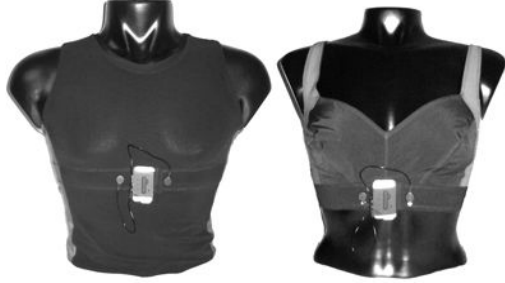
Figure 3. Custom made male base layer and female bra. Each include two textile electrodes, male snaps and a pocket for the Shimmer sensor.

walking exercise in order to ascertain functional, aesthetic and UI feedback. Participants were asked to wear, for males, custom made base layers and females custom made bras both consisting of textile electrodes and a small pocket for the Shimmer device (Figure 3). All participants wore a modified outer layer (water proof jacket), which included a Fibretronic soft-switch, headphones and a microphone.