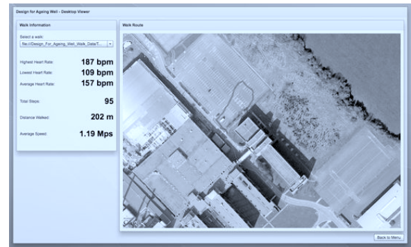
Figure 2. User Interface of the Desktop Viewer software showing an interactive map with recorded data overlaid and health and activity information.

An additional application has been developed to be run on the user's home computer that enables the configuration of the system and subsequent reviewing of the recorded data. Figure 2 shows the review screen of the 'Desktop Viewer' software.