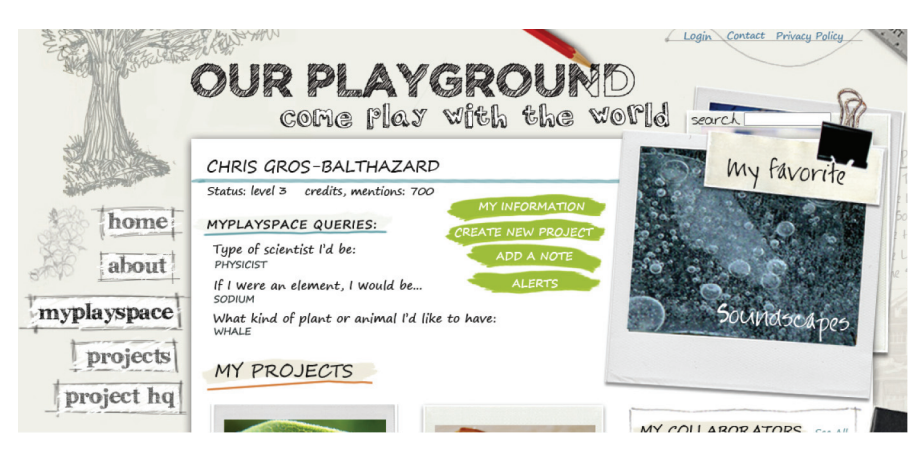
Figure 3. The Our Playground citizen science project

identify five areas which would benefit from harnessing the tools available via SNSs. Their research focuses on the U.S. but is applicable and relevant on a worldwide stage. They suggest establishing interactive domain centres critical to society's interests that would facilitate the exchange of information on key issues including healthcare, disaster response, environmental research and education. They also propose developing a media literacy initiative, aimed at educating the public on the use of various forms of media. Establishing person-to-person diplomacy, promoting peace and preventing crime is also suggested, as well as an ongoing national snapshot to provide continuous information about the population. Finally they propose a study of the role social networking plays in innovation to determine how SNSs relate to success.