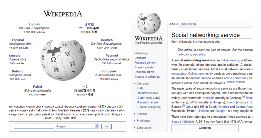
Figure 1. Wikipedia has over 75,000 collaborators creating articles in 10 different languages

Wikis empower students to be the cocreators of learning content. This fits in with the proactive approach to education promoting learning as an involving, shared experience as opposed to the passive absorption of fixed information generated by a teacher. As a wiki can be formed around any subject matter they are the perfect medium to develop group discussion projects for academic courses. Wikis promote collaboration and by sharing the construction of information, students as individuals gain important team-work skills. Creating a wiki requires little technical skill making the medium accessible to teachers and students from a variety of backgrounds. The information in a wiki is fluid and changeable to reflect the progress of knowledge and the changing needs of the users. By linking to and from other resources and related content wikis also contextualise knowledge and widen the scope of student understanding. Wikis preserve the history of a page allowing users to compare the most up-to-date version with previous revisions. This visibility can help teachers trace the activities of students and assess their overall contribution to a project (Kussmaul, 2011). Allowing all members of a wiki system the ability to modify all content has a number of drawbacks when applied to a classroom situa-