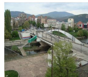
Mitrovica Bridge, Kosovo

Collaborative approaches are now becoming critical to addressing current and future macro problems such as regional development, city