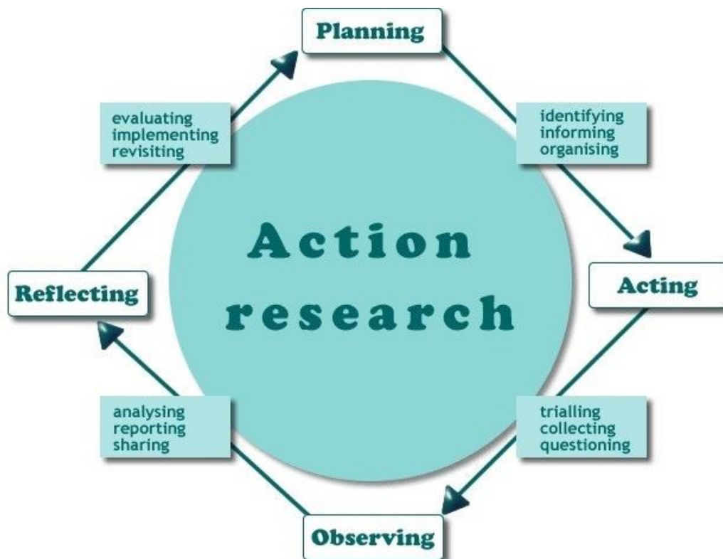
Figure 2. An action research cycle

qualitative narrative of participants. Koshy (2005) has recommended a simple model of plan-act-observe-reflect. A graphic representation is presented in Figure 2 (Interactive Design Foundation, 2016). This study has been designed to inform a systemic change. As such, the intent is to take action on the findings and improve the practicum experience. A mixed methods approach was taken with a naturalistic lens on a very complex teaching and learning experience. The practicum experience has been captured in an anecdotal format for approximately 17 years. A more formalized action research approach has allowed for a longitudinal strategy for acting on stakeholder feedback in the future.