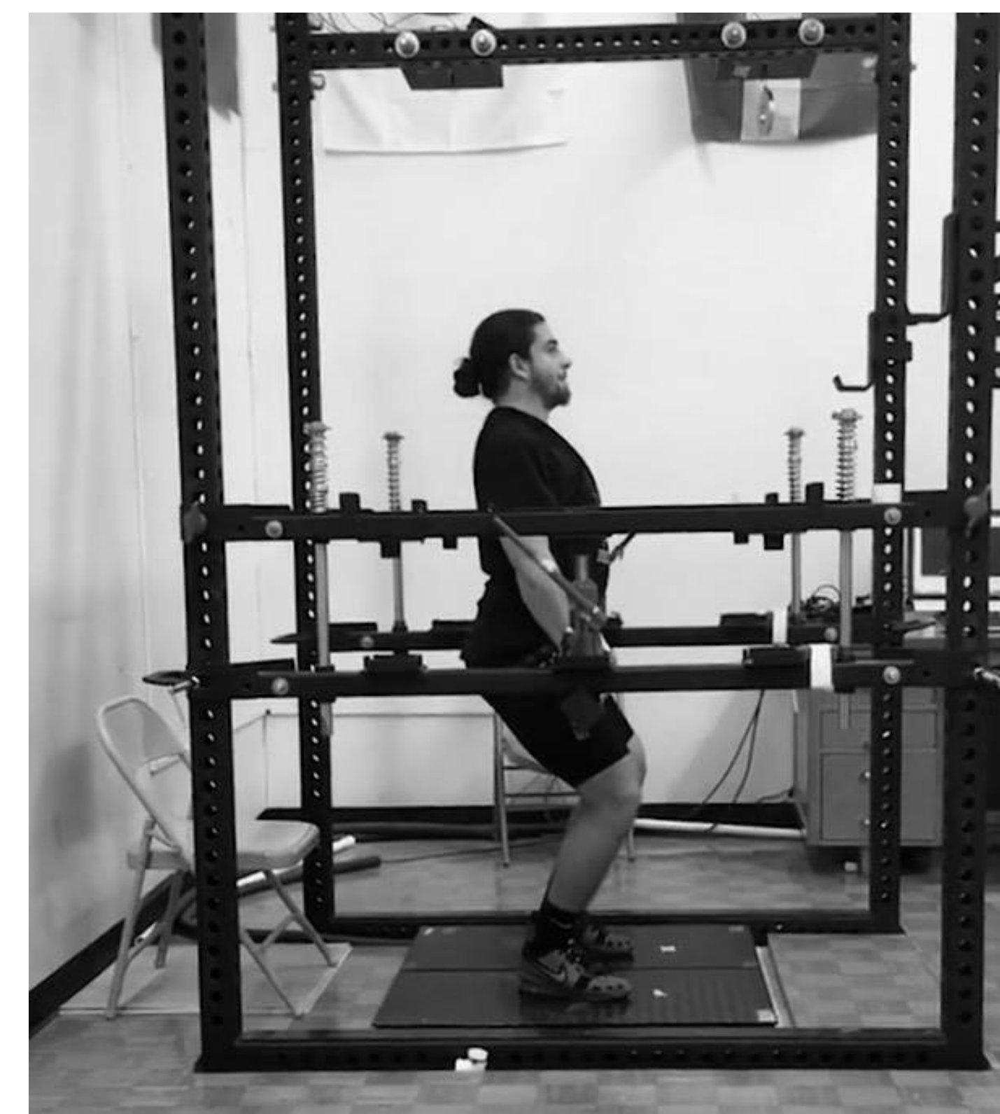
Figure 1. Isometric mid-thigh pull (IMTP)