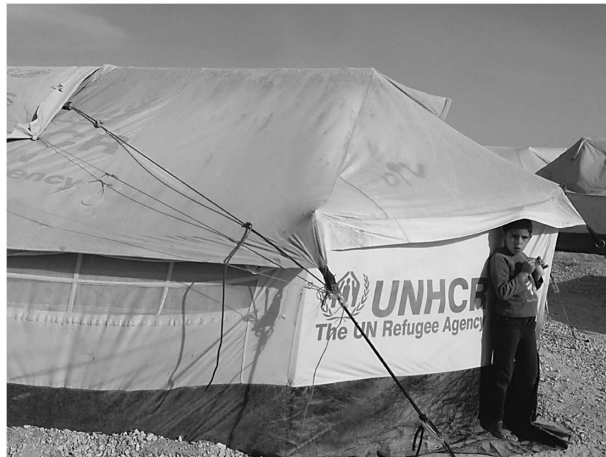
Photo 4. Zaatari Refugee Camp housing Syrian refugees

Palestine refugees achieve the following four human development goals: knowledge and skills, long and healthy lives, a decent standard of living, and full enjoyment of human rights. Regarding health as one of the organization's priority areas of activity, UNRWA is providing healthcare services to 3.1 million Palestine refugees at the moment (UNRWA 2017) (Photo 3). Jordan has a long history of accommodating Palestine refugees, more than two million of whom are now living in the country, and some long-established camps even appear to be regular residential neighborhoods at a glance. After the recent humanitarian crisis in Syria, however, the situation has become increasingly complex due to a fresh influx of Palestinians from Syria into Jordan and other neighboring countries.