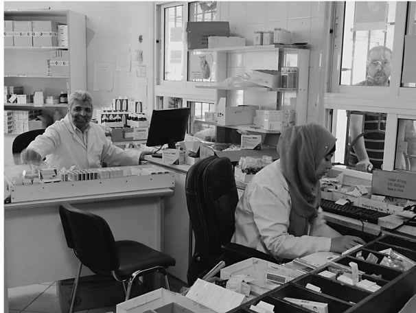
Photo 3. A healthcare clinic managed by UNRWA inside a Palestine refugee camp in Amman (©Yasushi Katsuma, Amman/2017JUN19)