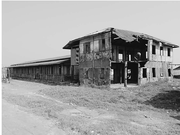
Photo 2. A Devastated Rohingya Elementary School