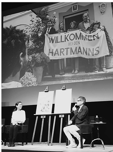
Photo 1. The 12th UNHCR Refugee Film Festival in Japan

starting in January 2018 under the title Hajimete no Omotenashi . 2