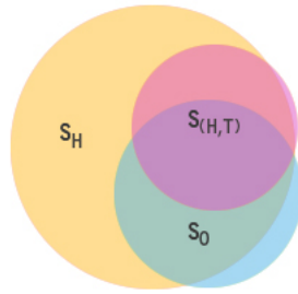
Figure 2: Overlap Diagram between \mathbf{S}_H , \mathbf{S}_{\langle H,T \rangle} and \mathbf{S}_O

where X can be \mathbf{S}_H or \mathbf{S}_{\langle H,T \rangle} . However, using only Equation 1 is not sufficient because inferior patterns would have similar low precision distribution in both \mathbf{S}_H and \mathbf{S}_{\langle H,T \rangle} .