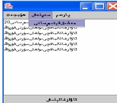
figure 2 Uighur speech recognition system training interface