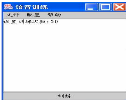
Figure 3 Chinese speech recognition system identify interface