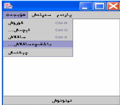
Figure 1 Uighur speech recognition system identify interface