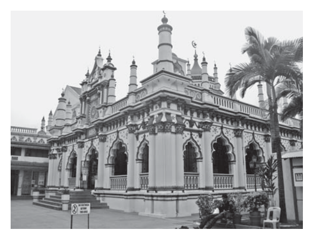
fig. 9 The Masjid Abdul Gafoor

held at the ACM and the author was able to see it during her visit. The Aga Khan created the world famous Islamic art collection and this exhibition gave a special opportunity to people in Singapore to see a wide variety of superb art objects from Islamic Spain, Egypt, Syria, Turkey, Iran and India. The exhibition space was carefully arranged so that visitors could understand and experience the space characteristic to Islamic lands. The accompanying catalogue, which was written by leading scholars in Islamic art, is a great source of information that paves the way for further exploration<sup>(25)</sup>.