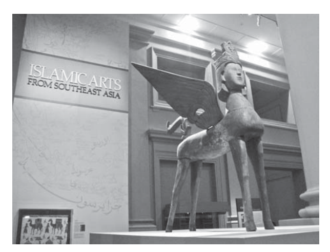
fig. 5 Gallery for the special exhibition "Islamic Arts from Southeast Asia"

Generally, in the history of Islamic art, "Islamic art" has been defined as "art produced in Islamic lands," or "art produced for Muslims," or "art produced by Muslims<sup>(18)</sup>." However, in order to make the exhibition more accessible to the general public, instead of such definition, the exhibition was organized to start with objects related to the Qur'an and religious furnishings, such as a Myanmar Qur'an box,