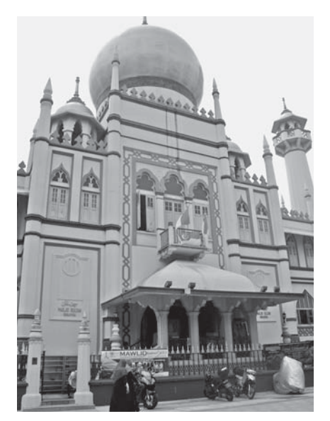
fig. 8 The Sultan Mosque