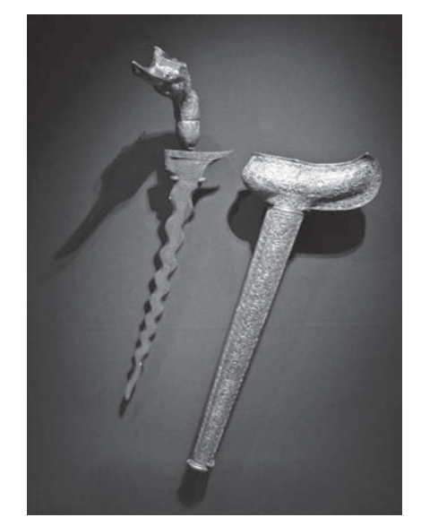
fig. 6 Blade of Keris, Java, perhaps 17th century (xxxx-03981)