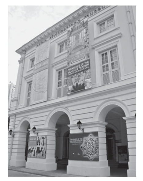
fig. 1 The Asian Civilisations Museum, Singapore

In the study of Islamic art history, which has focused on Islamic art and architecture formed in the