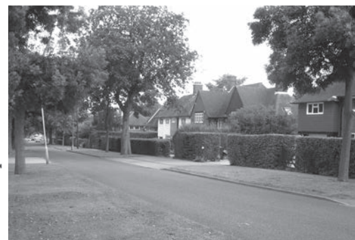
Fig. 2. Dwelling Quarters, Letchworth