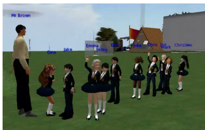
Figure 2: Demonstration of a virtual class being undertaken with teacher/student avatars

Finally, one student summed up their experience with the following: “Thanks so much for setting this up - it was hilarious and a lot of fun, as well as being educational. Really appreciate this opportunity”. Many learners throughout Australia and New Zealand have been provided with similar opportunities over the past 10+ years and each respondent would have very similar stories to share.