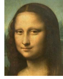
Figure 2. The color image of Mona Lisa used.

If the difference between the pixels in a small neighbor block of the pixel is not significant, we can replace the blue channel with another channel for gradient calculation. In this paper, we choose the red channel.