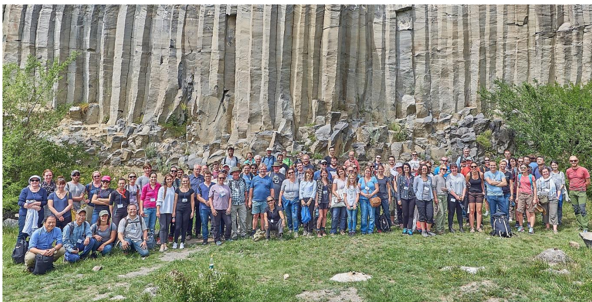
Figure 2: Participants of the field conference entitled ‘Crossing New Frontiers: Tephra Hunt in Transylvania’ standing in front of columnar basalt in the Perșani volcanic field (active 1.2–0.6 Ma) in the southern Carpathians, Romania, during the mid-conference field trip.