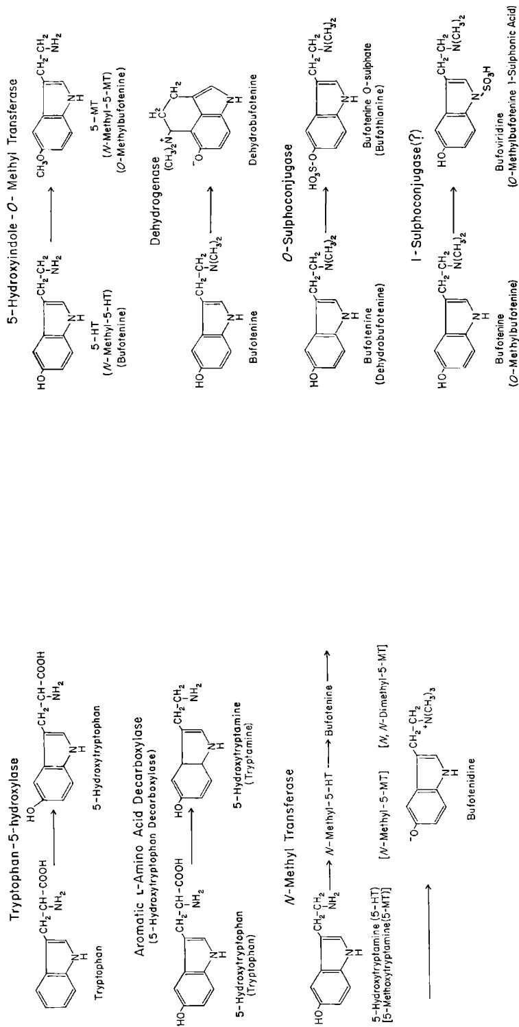
FIG. 1.—Biochemical pathways for 5-hydroxyindoler.