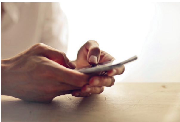
Photo: The proliferation of mobile technology use in low- to middle-income countries offers opportunities for research studies in cognitive ageing and brain health.

Without doubt, invaluable lessons have been learnt from years of work and experience acquired conducting research in rich countries. Yet, differences in the context of LMICs are likely to require innovative approaches for the acquisition of data at a larger and global scale. The implementation of cheaper and less resource demanding means of gathering data in these re-