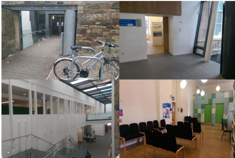
(Figure 2) Top left: Entryway; Top-right: Foyer; Bottom-right: Main waiting room; Bottom-left: atrium

The ‘walk-in’ access route offers the opportunity to arrive at the facility unscheduled, without an appointment. The ‘walk-in’ runs from 8.30am - 10am, Monday to Friday, although access into a peripheral foyer waiting area is available from 7am, providing a discrete waiting area, as well as shelter from the inclement weather. Each attendee to the ‘walk-in’ must pick up a numbered triage card, on display in the foyer, in order to be assessed by the triage nurse. The cards specify the rules of access to the ‘walk-in’, which include noting that ‘if an urgent walk-in slot is not required the nurse will explain how best to get an appointment with a GP’.