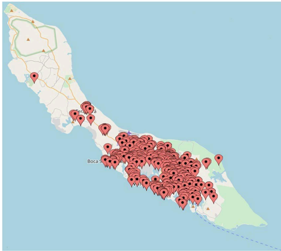
FIGURE 3 | The locations of a selection of the patients on Curaçao that tested positive for ZIKV by qRT-PCR. The map was created by plotting the locations on www.mapcustomizer.com .

introduction of the virus to be earlier, either between August 2013 and July 2014 (38) or between May and December 2013 (39). On Curaçao, according to our analyses, the first cases of ZIKV were diagnosed in December 2015, a month before the first notification to the WHO on 28 January 2016 (24), which indicates that the virus, most likely introduced by travelers, emerged earlier than officially reported. Given the rapid spread of the virus throughout the Americas after its emergence in Brazil, Curaçao, and Bonaire were not prepared for an outbreak of ZIKV, and diagnostic assays had therefore not yet been implemented and validated at MLS. This problem was circumvented by shipping patient samples to the diagnostic laboratory of the EMC in the Netherlands, a WHO Collaborating Centre for arboviruses. Starting from October 2016, MLS Curaçao had implemented the necessary commercial diagnostic qRT-PCR assay and ELISAs in order to continue the diagnosis of ZIKV-suspected patients on Curaçao and start with the diagnostics for Bonaire. Of note, this study was not designed prospectively but performed in reaction to a dynamic outbreak situation.