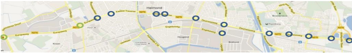
Image 1: FREILOT 14 equipped intersections in the urban zone. City of Helmond.

After FREILOT, Helmond has been an active partner in the Compass4D project, with the aim of scaling up the results of FREILOT and making the transition towards large scale deployment of these C-ITS services easier.