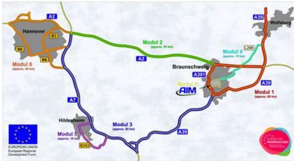
Figure 1: Testbed lower saxony, and the linking to AIM test site in Braunschweig