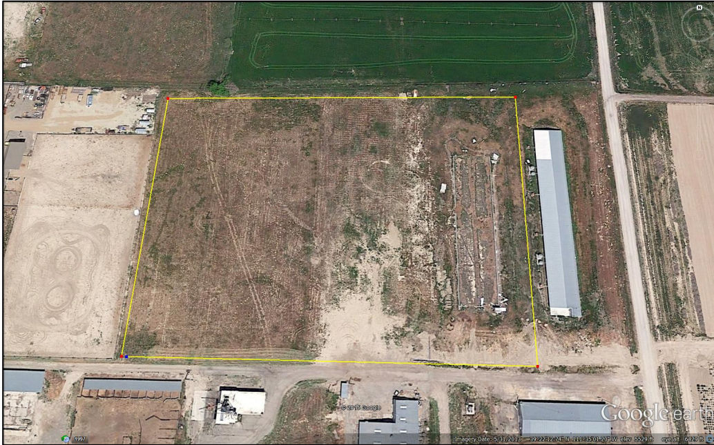
Figure 1: Google Earth screen shoot of new pasture to be fenced (outlined in yellow lines).

is especially helpful because a ruler tool can be used to accurately measure distances. This will help inform important decisions such as where to put gates, alleyways, or watering sites, as well as help estimate the amount of materials needed to complete the project.