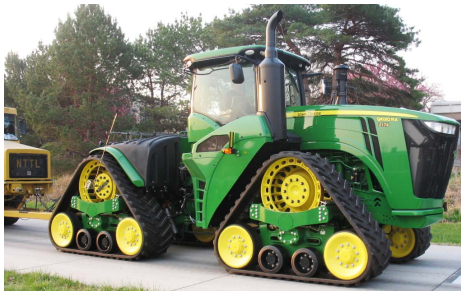
JOHN DEERE 9620RX DIESEL