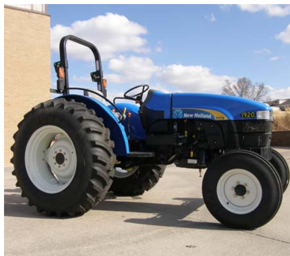
New Holland TT 75A Diesel

Institute of Agriculture and Natural Resources University of Nebraska-Lincoln