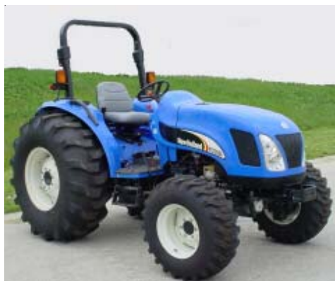
New Holland TC55DA Diesel

Institute of Agriculture and Natural Resources University of Nebraska-Lincoln