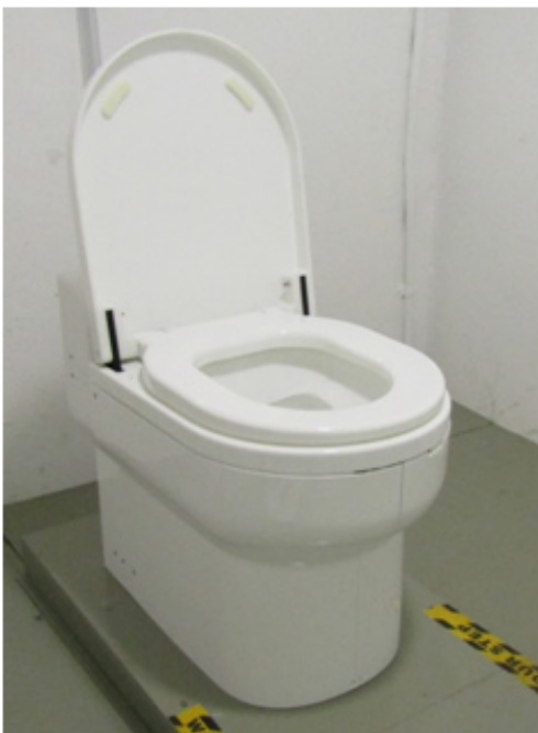
Figure 2. Nano Membrane Toilet front-end prototype.

Naturally, there are numerous considerations to be made during the development of such a technology. The NMT combines entirely novel technologies with already existing ones. However, even for the well-established technologies, their application for this specific purpose is novel, and requires further research in order to miniaturise, integrate and optimise for off-grid functionality. At the same time, from a user's perspective, not much should change when transitioning from using another