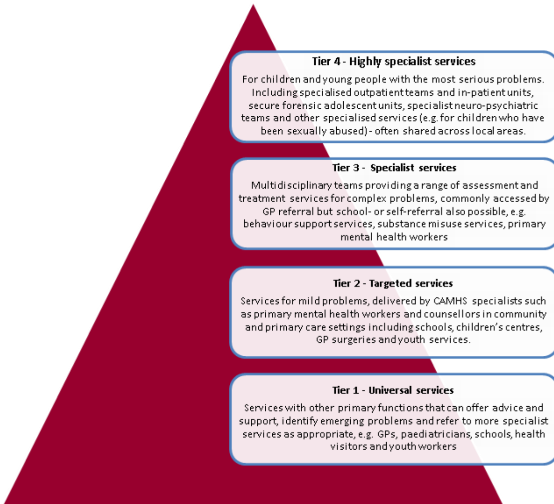
Figure 3. The four tiers of comprehensive CAMHS 188