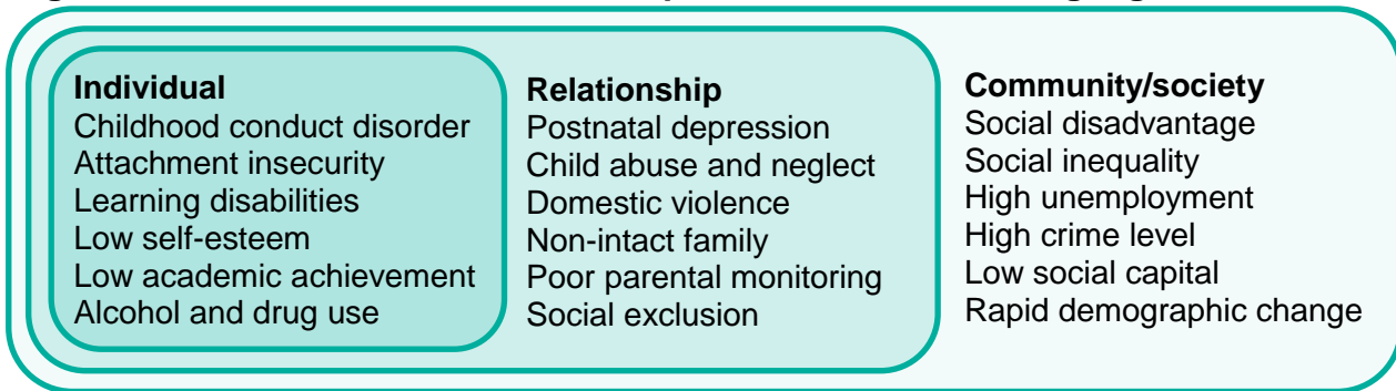
Figure 2. Some shared risk factors for poor mental health and gang-affiliation 39,40,43-45

Mental health and gang-affiliation can also be linked through shared risk factors. A wide range of factors can increase young people’s risks of poor mental health 39 and gang-affiliation, 40 and many are common to both. Figure 2 provides examples of shared risk factors that relate to individuals, their relationships, and the communities and societies in which they live. Risk factors tend to have a cumulative impact on negative outcomes, and gang affiliated young people often show a multitude of risk factors across different domains. 41,42 The following sections highlight four examples of important shared risk factors: adverse childhood experiences, attachment insecurity, social exclusion and disadvantaged neighbourhood environments.