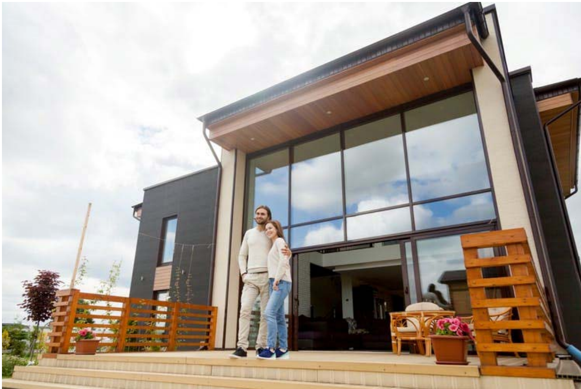
Some young people are living the dream.

But all of these arguments conveniently ignore the inequalities within generations, which are greater than the inequalities between them. Not only is there considerable inequality within cohorts, even greater divides are created by gender, ethnicity, disability, housing tenure and class.