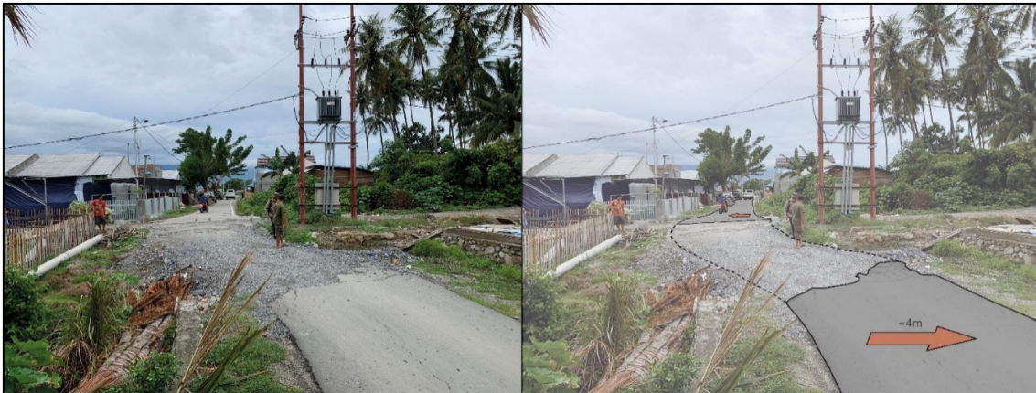
Figure 2. Offset road due to strike-slip fault displacement.