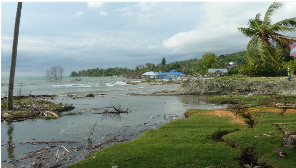
Figure 6. Area of land lost to coastal slumping due to liquefaction at Lero.