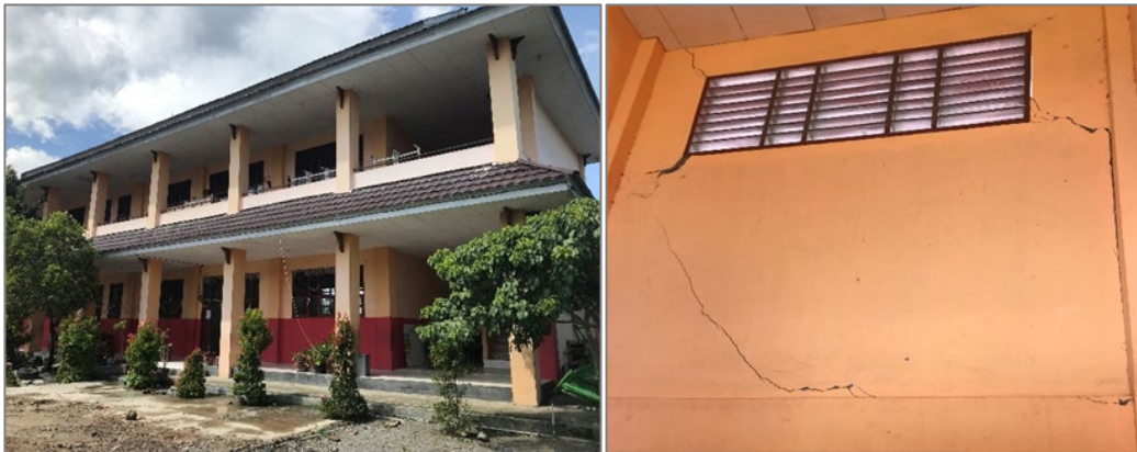
Figure 12. Damage to infill walls in a 2-storey RC school building in SD Negeri Pengawu School in Palu (Building A in Fig. 7.24).