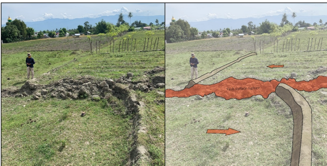
Figure 3. Displacement of approximately 5m along fault surface rupture shown due to offset rice paddy terraces.