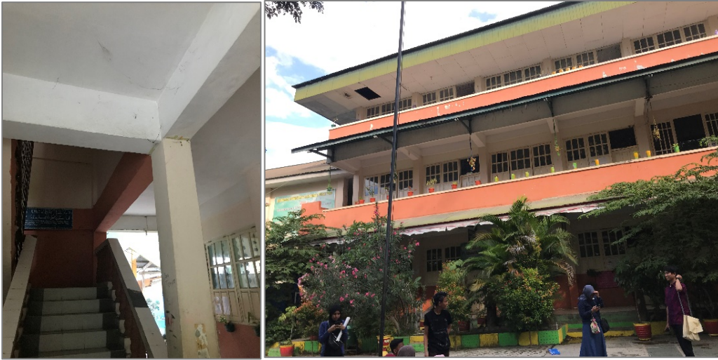
Figure 11. MTS Alkhairaat Pusa Palu School. Left – 3-torey RC frame building that sustained minor damage to infill panels. Right – Typical sizes of beams and columns in RC frame schools.