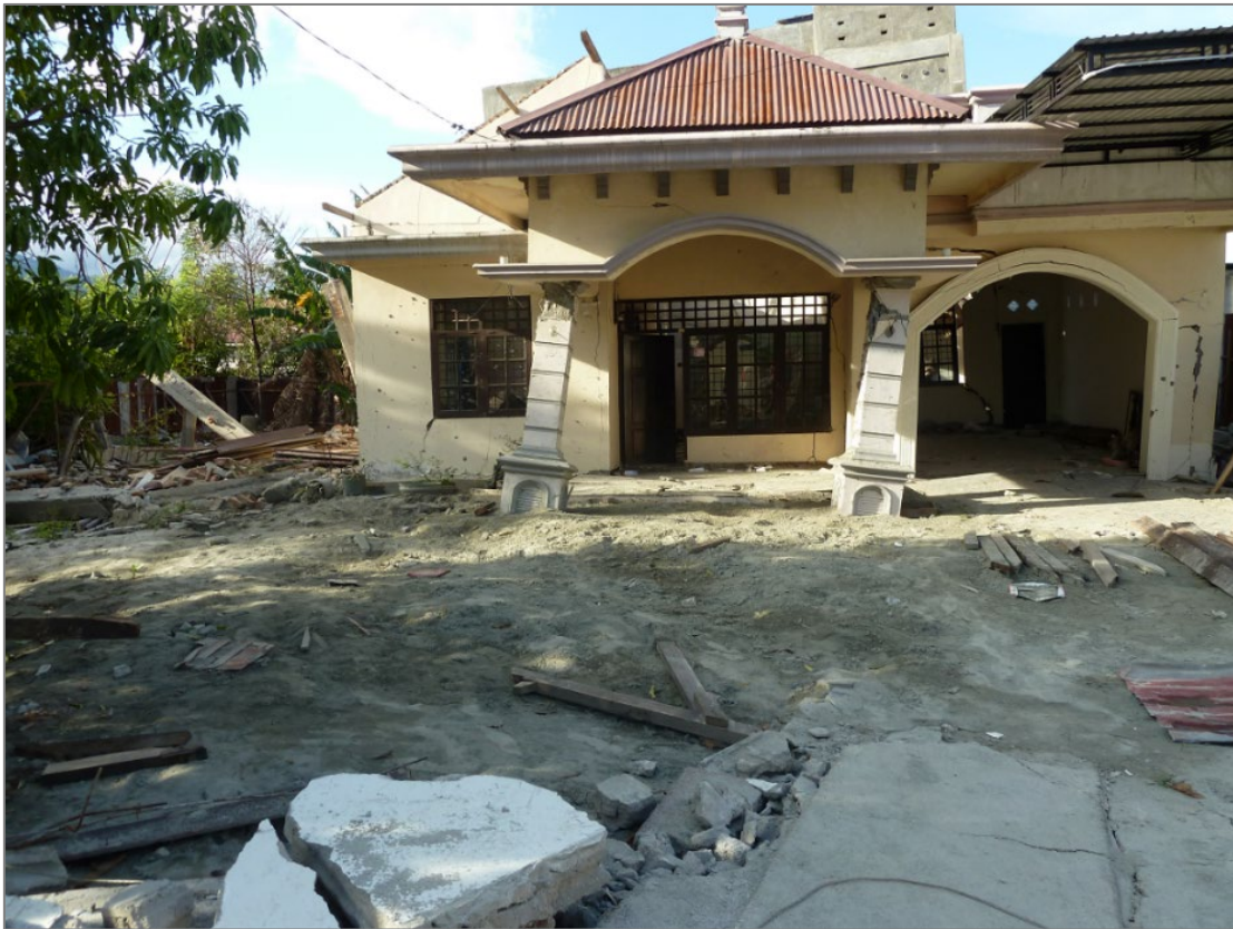
Figure 5. Damage to a one-storey building in Lasoso due to differential settlement induced by liquefaction. Sandy ejecta in garden.