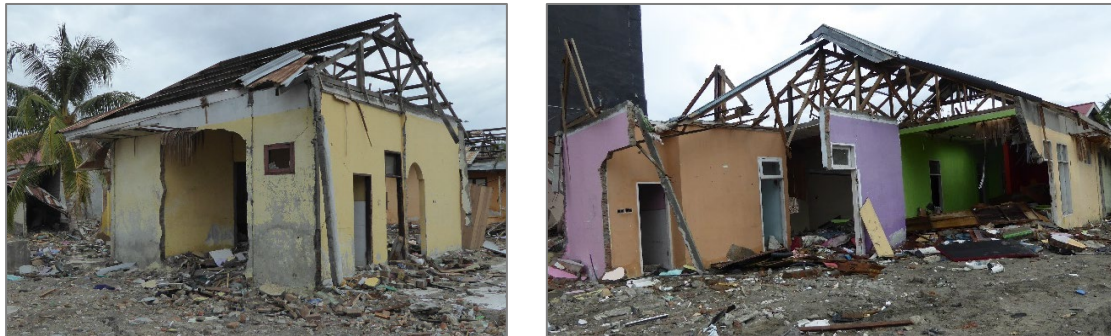
Figure 9. Heavily damaged CM houses in Palu bay area along the Jl. Rajamoili road, about 100m from coastline. The walls of this house were directly hit by the tsunami inundation.

The most common non-engineered construction observed in Palu is confined masonry (CM). Typical damage sustained by CM houses along the coast line in Palu bay area is shown in Figure 9. The main damage pattern is the out of plane failure of walls directly hit by the tsunami waves. In the case of earthquake ground shaking the weak materials used for both the masonry and confining elements resulted in out-of-plane failure of the masonry and cracking and failure of tie-columns.