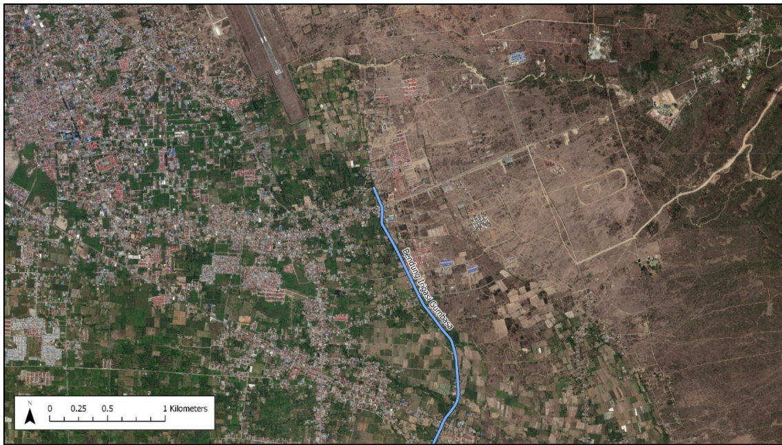
Figure 4. Difference in vegetation growth due to groundwater conditions on either side of the Bendung Irigasi Gumbasa. Green vegetation growth (left) indicates wetter ground conditions as opposed to brown land with lack of vegetation growth (right) indicating mostly dry ground.