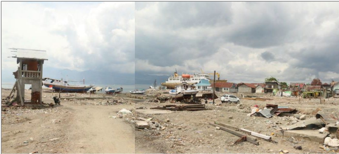
Figure 8. Wani village on the east coast of Palu bay which experienced considerable damage.

Despite causing considerable damage along the shoreline (Figure 8), the horizontal inundation of the tsunami was relatively modest. This is an indicative characteristic of landslide generated tsunamis. There was no evidence of the tsunami having travelled up the Palu river at the southern end of the bay, which is in contrast to what has been found on previous EEFIT missions e.g. Japan 2011. A possible reason for this is that the collapsed Palu Bridge IV created a barrier to the tsunami; the collapse of the bridge occurred due to the earthquake ground shaking.