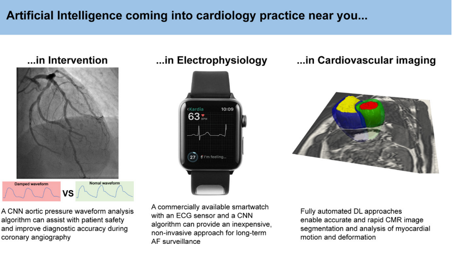
Figure 2 Artificial intelligence in cardiology: examples of applications in interventional cardiology,<sup>7</sup> electrophysiology<sup>5</sup> and imaging.<sup>2</sup> AF, atrial fibrillation; CMR, cardiovascular magnetic resonance; CNN, convolutional neural network; DL, deep learning.

medical image recognition is convolutional neural networks in which smaller generic spatial features are abstracted from the input data. The many iterations of training, as well as hyperparameter optimisation, often require the parallel processing capabilities of a high-performance graphics