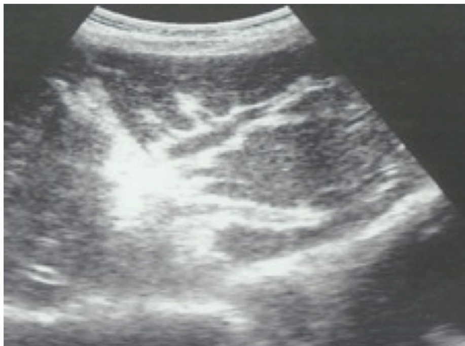
Figure 1. Ultrasound image of periportal fibrosis in S. mansoni infection. The image was taken during ultrasound examination of a study cohort from Piida village on the shores of Lake Albert, Uganda, in March 2004 and illustrates liver texture pattern C with “pipe-stems.” doi:10.1371/journal.pntd.0001149.g001

Utilisation of ultrasonography in community-based studies showed that prevalence of periportal fibrosis peaks in adulthood, with cases detectable into middle age, even when S. mansoni infection intensity drops dramatically in early adulthood (Figure 2) [22–25]. Some studies do, in agreement with the autopsy studies, find an association between periportal fibrosis and S. mansoni infection intensities; however, the strength of S. mansoni intensity’s influence on the presence of periportal fibrosis is weak in comparison to that of age and sex [9,23,25,26], and other studies fail to find an association [8,22,27,28]. The lack of consensus about the influence of infection intensities on periportal fibrosis