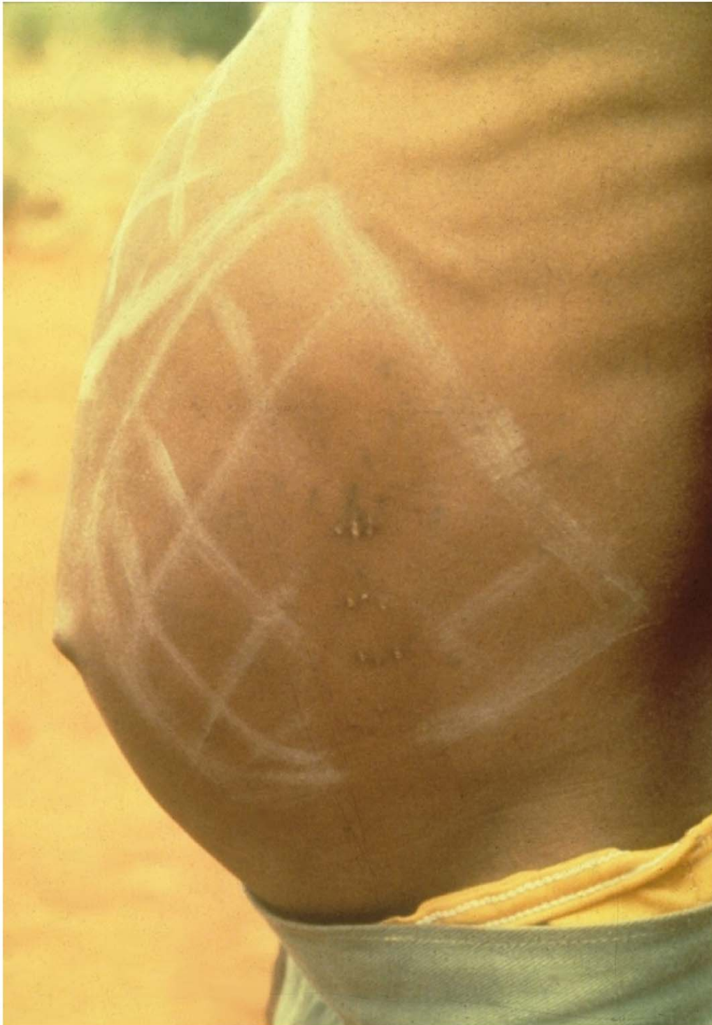
Figure 3. Hepatosplenomegaly in a school-aged girl with schistosomiasis, Kambu, Makueni District, Kenya. The photograph was taken during field studies carried out in 1988. Extent of palpable organs are indicated by chalk markings. The scarification seen is from “treatment” of organomegaly administered by traditional healers. The traditional healer will make small cuts at the edge of the palpable organ. When several rows of scars are seen (as shown), this represents repeat “treatment” and therefore shows the progression of organ enlargement with time. doi:10.1371/journal.pntd.0001149.g003

Pfs-IgG3 malaria exposure marker, and levels of IL-10 and sTNF-RII are significantly greater in children who are co-infected with P. falciparum and S. mansoni [62]. Furthermore, Th2 responses to SEA are down-regulated by P. falciparum infection [40]. The results of cytokine analysis, from cells stimulated with schistosome antigens